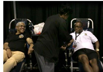
Members of Alpha Phi Alpha donate blood during the Alpha Phi Alpha Fraternity convention in Charlotte, N.C.

As part of its annual convention on Aug. 8 in Charlotte, N.C., the Alpha Phi Alpha Fraternity, Inc. hosted a community blood drive with the Community Blood Center of the Carolinas (CBCC). Members of Alpha Phi Alpha donated blood during this event and at CBCC's Charlotte donor center, exceeding its goal of 30 units of blood. The blood drive was also part of the Carolinas Sickle Cell Collaborative (#StepUp4Sickle) – a partnership with CBCC, regional healthcare and sickle cell advocacy partners, and local African American groups – to support local sickle cell patients who often require multiple blood transfusions for their treatment.